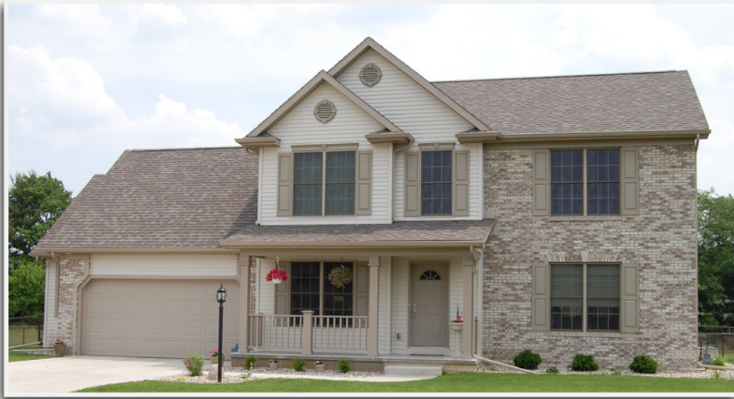
Shown with Brick accent option.